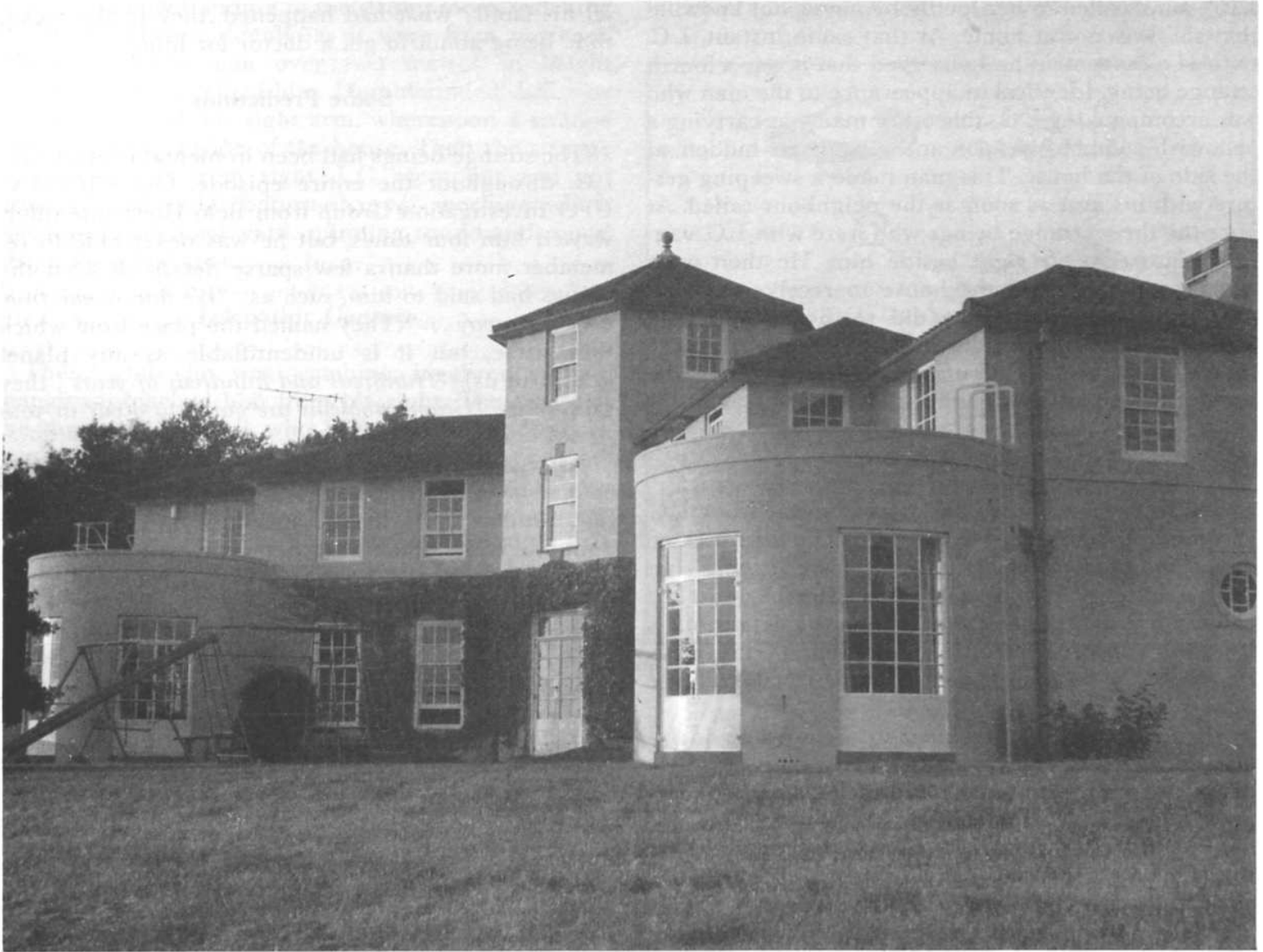
High Hurlands Hospital, Passfield, Hants. Door centre, where entity appeared.

Consultant to FSR. Chairman, S.I.G.A.P. (Surrey Investigation Group on Aerial Phenomena, Guildford, Surrey). (As originally published in S.I.G.A.P. Journal PEGASUS for November/December 1980.)